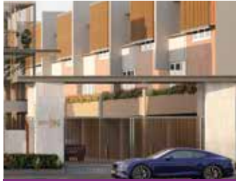
GATED COMMUNITY VILLA / PLOTS

Propshell is one of the few established real estate players in Chennai that caters to all asset classes and further adds value to customers with their end-to-end solutions. Our customers have one- single-partner serving their 360-Degree property needs.