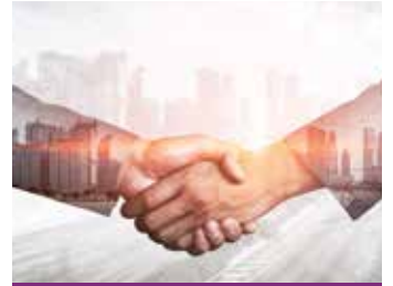
JOINT VENTURE & PLOTTED DEVELOPMENT