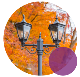
FULLY LIGHTED CAMPUS