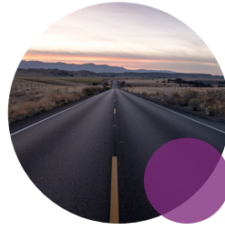
40FT BLACKTOP ROAD