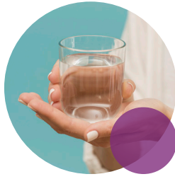
POTABLE DRINKING WATER